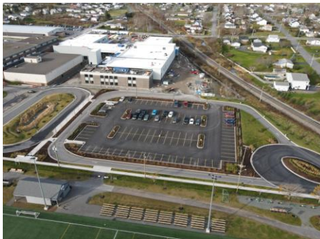
Aerial of current progress